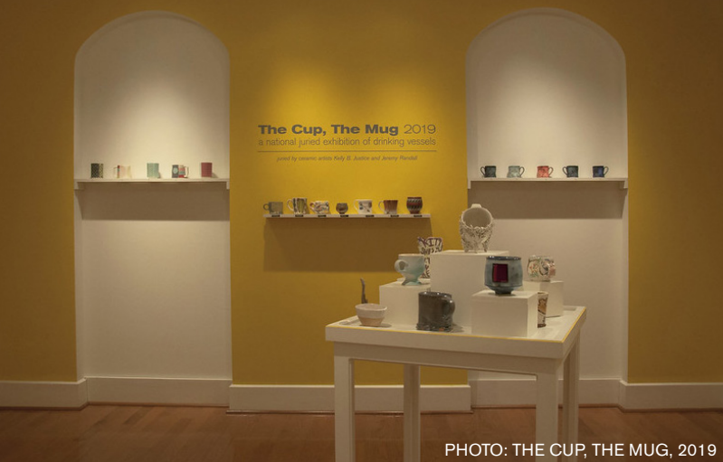
PHOTO: THE CUP, THE MUG, 2019

A national juried exhibition, open to all U.S. artists working in ceramics, glass, wood, or metal. Submissions must be cups, mugs, or other drinking vessels. All work submitted must be for sale.